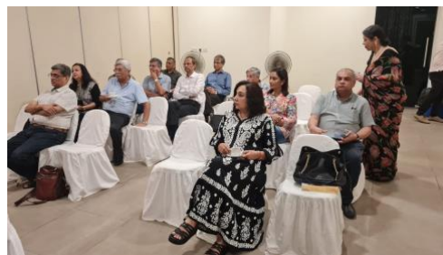
Innercity Members at the RWM