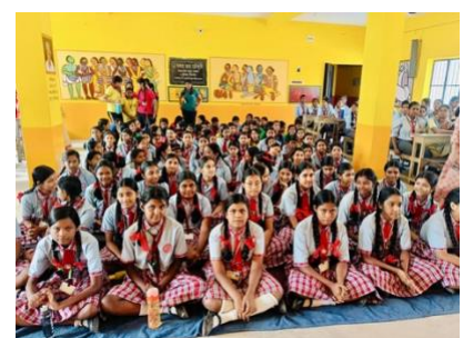
Teachers' Day Celebration at the School